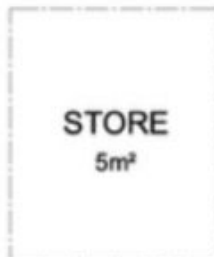
STORE 5m 2