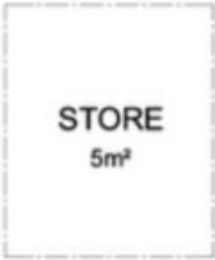
STORE 5m 2